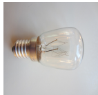
15W E14 Clear Ball Incandescent