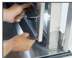
Removable Ledge Panels