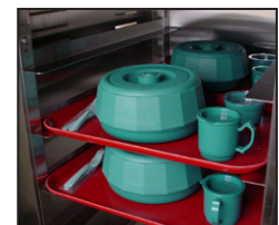
Two Trays Per Ledge