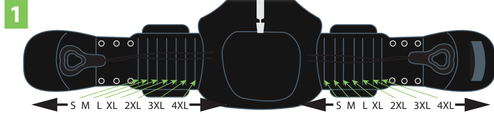
(Figure 1) Match the size using the chart to fit your waist match your belts size. Remove Hook & Loop from belts and pull the tabs through to the sizing creases, securing the sizing flap with Hook & Loop to your appropriate crease 1,2,3,4,5,6,7. For your appropriate size, see green chart below and reference sizes.