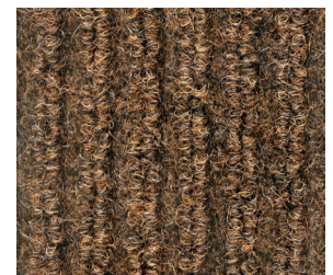
Toughrib Contract Brown