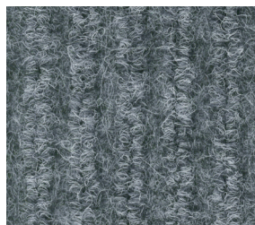
Toughrib Contract Grey