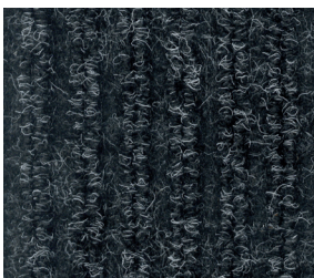
Toughrib Contract Charcoal